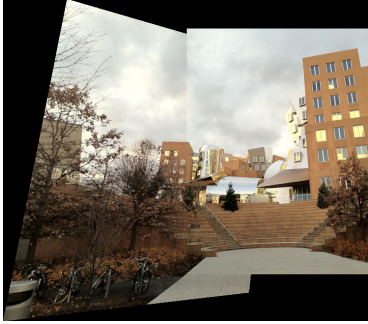
(a) Stata Stitch