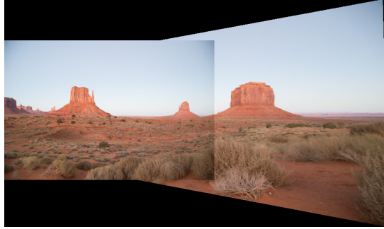
(b) Monu Stitch